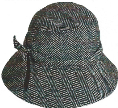
WOOL HERRINGBONE CLOCHE $13, Old Navy 800-OLD-NAVY