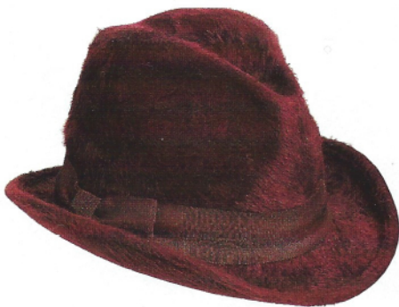
FELT BEAVER FUR FEDORA $225, Makins Hats. Proper Topper, Washington, DC 888-842-3055