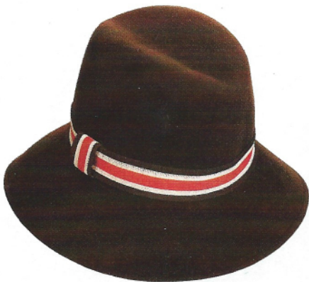
VELOUR FEDORA WITH STRIPED BAND $90, Hat Attack. Select Plaza Too stores 800-972-4179