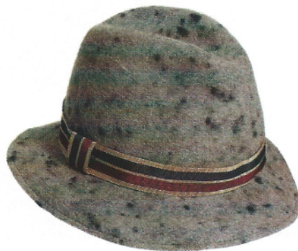
SPOTTED ANGORA FELT WITH RIBBON BAND $250, Selima. Selima Optique, L.A. 323-653-4400