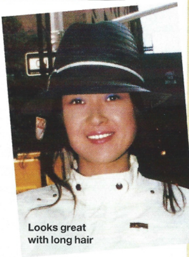
Looks great with long hair

THANK MADONNA ONCE AGAIN FOR THIS MODERN, FEMININE VERSION OF THE CLASSIC BOGART-INSPIRED HAT, A LITTLE '40S NOIR FOR THE LADIES.